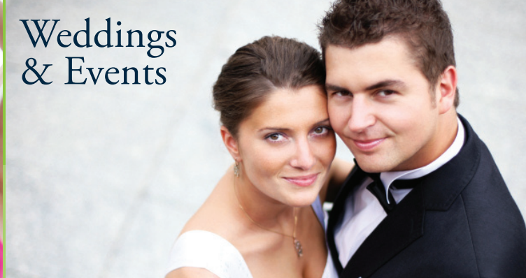
Weddings & Events

Set in the beautiful Amber Valley, just outside Chesterfield, Ashover Parish Hall Events Centre is a modern, multi-function, events centre that is designed to meet the requirements of the most discerning business and social user.